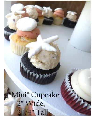
"Mini" Cupcake: 2" Wide, 2 1/4" Tall (shown with custom décor)